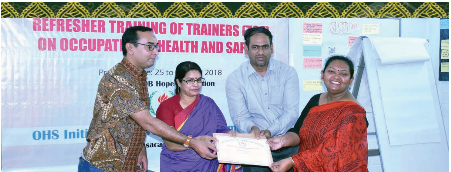
Graduates of the 2017 training program receive certificates for successfully completing the April 2018 refresher course.