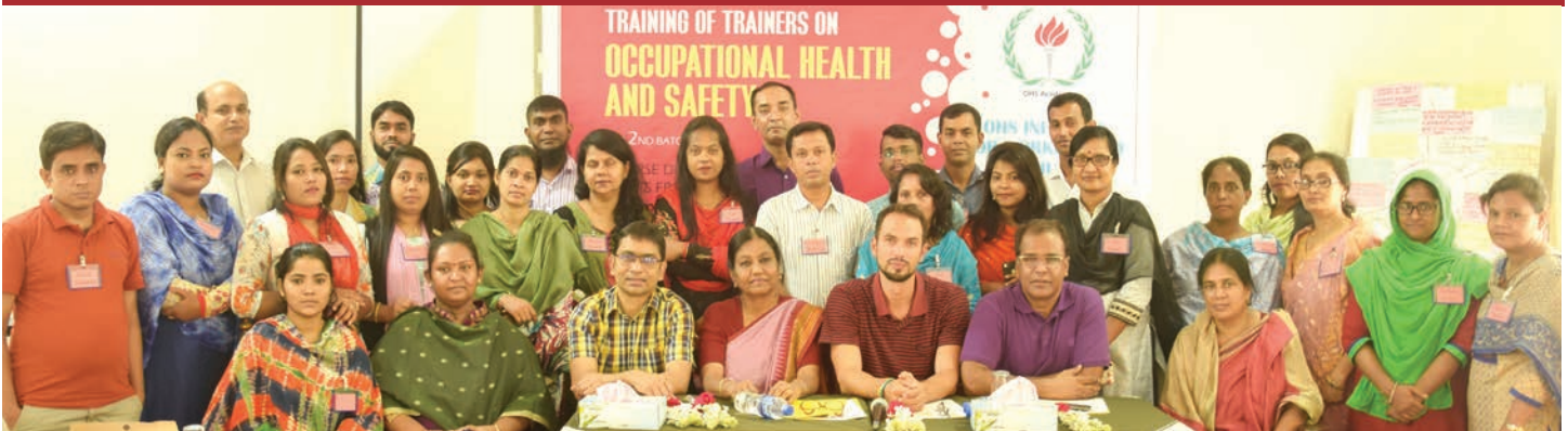
Participants in the Initiative's 20-day "Training of Trainers" course for the second group of worker educators, June-October 2018.