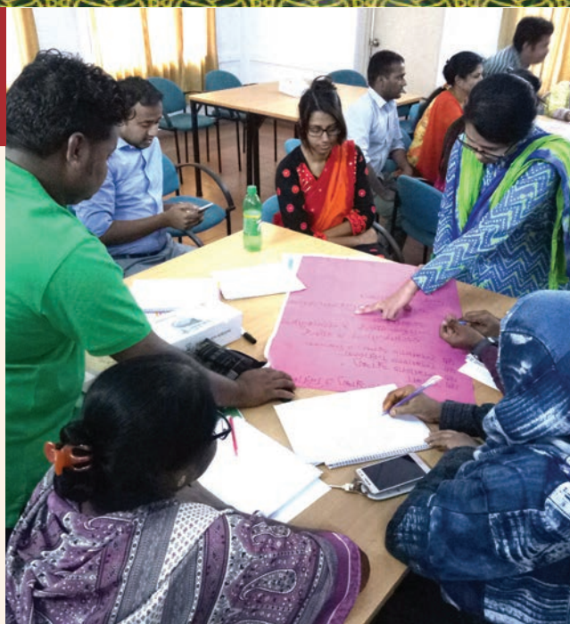
Graduates of the first Training-of-Trainers program (2017) work together in a 5-day "refresher" training in April 2018 to support them in leading their own OHS workshops with workers and community members.